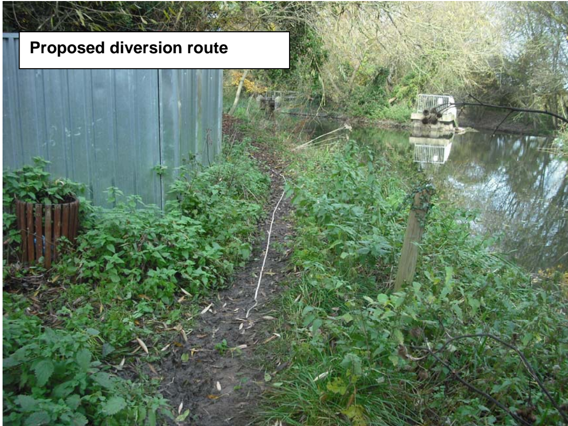
Looking north-north-west along the proposed diversion route at the point where the legal line crosses the Riddy Brook (point D on the plan)