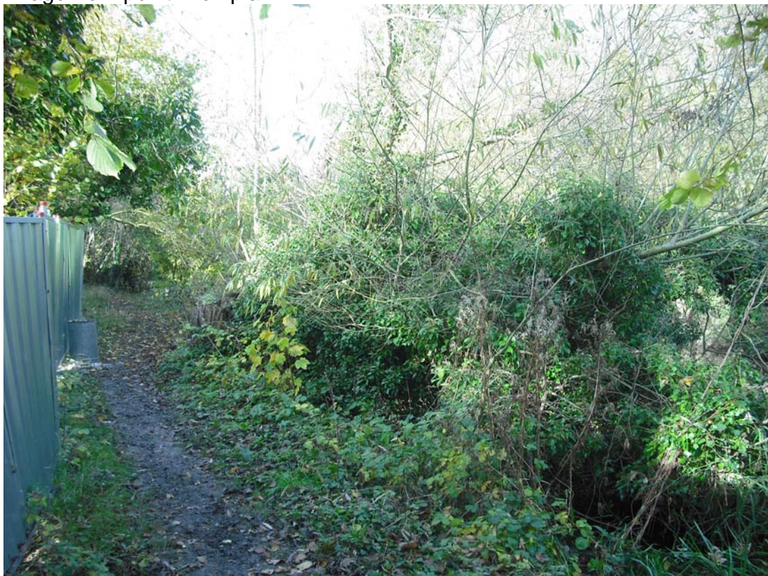
Looking north west along proposed route between sluice and point E