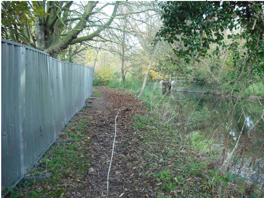
Looking north east along proposed route near the weir