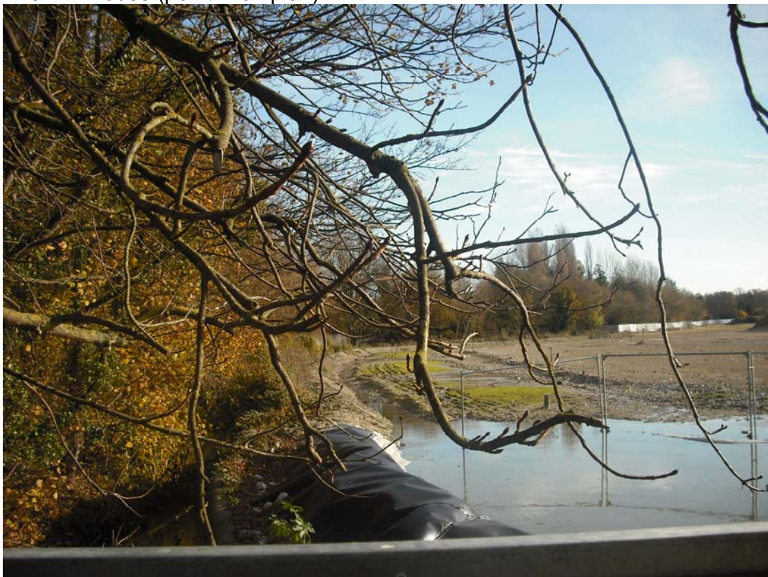
Looking south east along the legal route of FP1 (closed section) taken from the bridge adjacent to The Mill House (point A on plan).