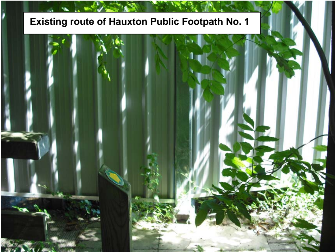
Looking south east at closed section of legal route of Hauxton FP1 adjacent to The Mill House (point A on plan).