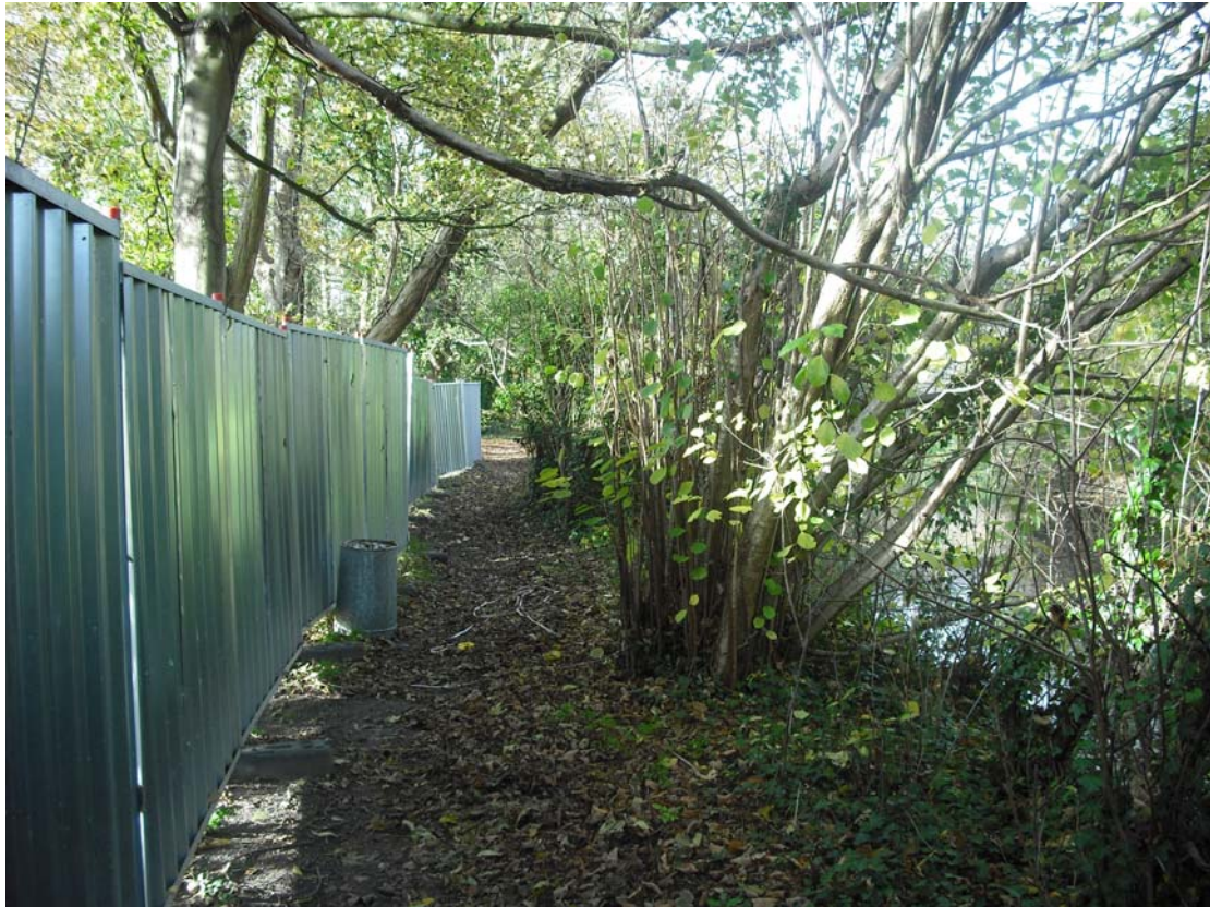
Looking north west along the proposed diversion route towards point E on plan