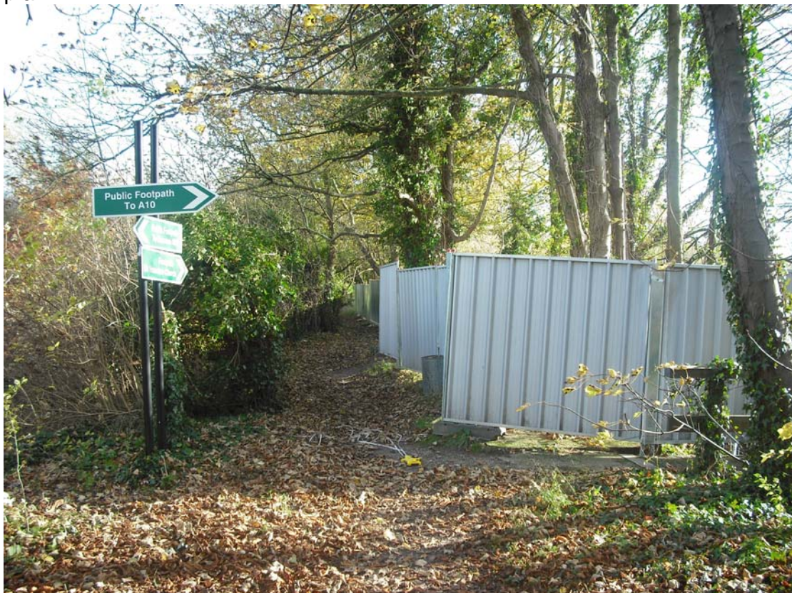
Looking south east along proposed diversion route from junction with Hauxton Public Footpath No.4 (point E)