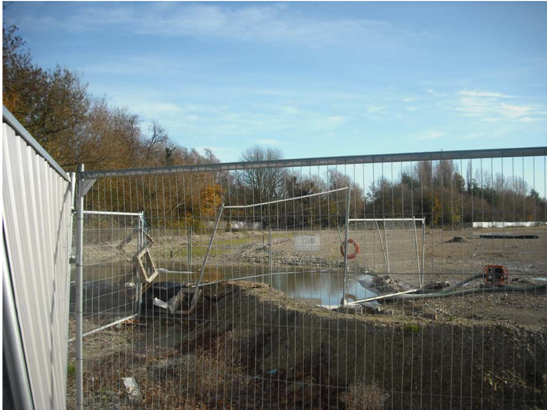
Looking south east along the legal route of FP1 (closed section) from Hauxton Public Footpath No. 5